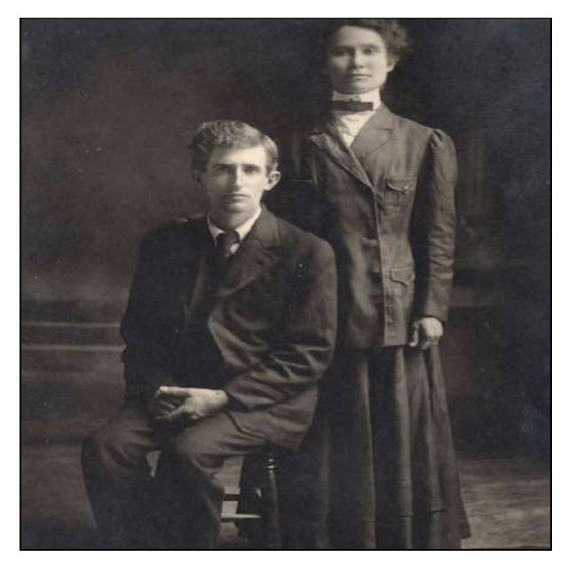
"Vintage Studio Portrait of Unknown Relations"

have heard the same, with a paralyzed inability to accept its significance. She wept at once, with sudden, wild abandonment, in her sister's arms. When the storm of grief had spent itself she went away to her room alone. She would have no one follow her.